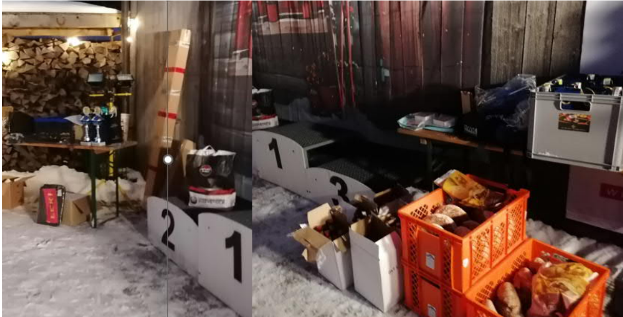
Prizes for the award ceremonies at the BCh and GCh on Day 1