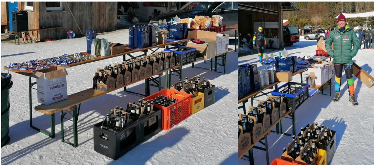
Prizes for the award ceremonies at the BCh and GCh on Day 2

A total of 54 participants registered for the first day of racing; 5 did not show up at the start and one withdrew, meaning that only 48 participants were included in the final standings.