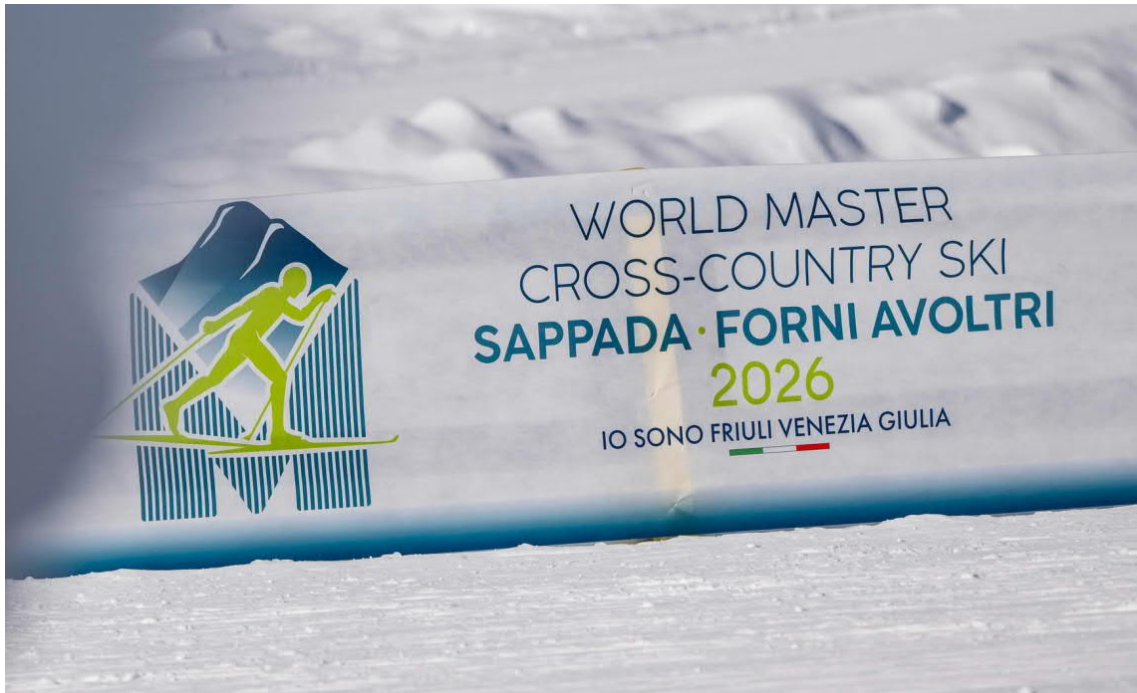
Photo gallery from Sappada and Forni Avoltri at the 2026 World Cup: