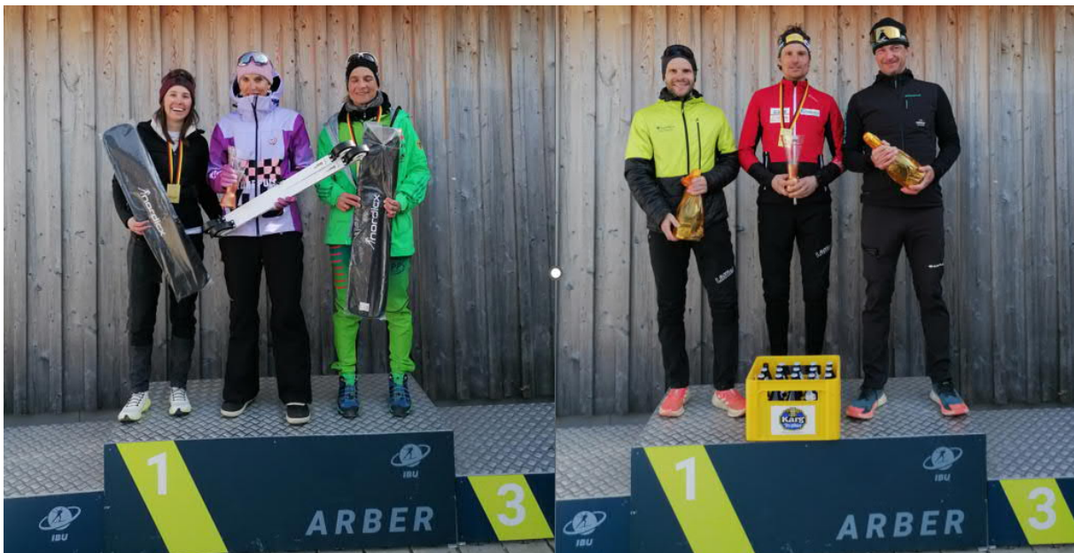
Awards Ceremony for the Men's and Women's Masters Overall Standings

The German Championship was seen as a successful event following the club relay races. The goal should be for the Masters athletes to continue participating, even though the season is very long and the courses aren't exactly the easiest. But even at the Masters World Cup, we often face challenging courses and tough climbs.