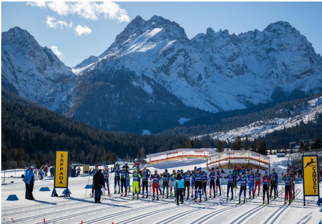
The starting area at the Sappada Ski Stadium, set against the stunning backdrop of the Dolomites