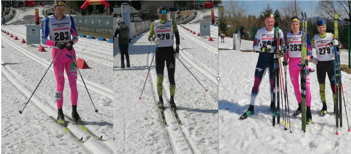
The winners crossing the finish line in the men's race