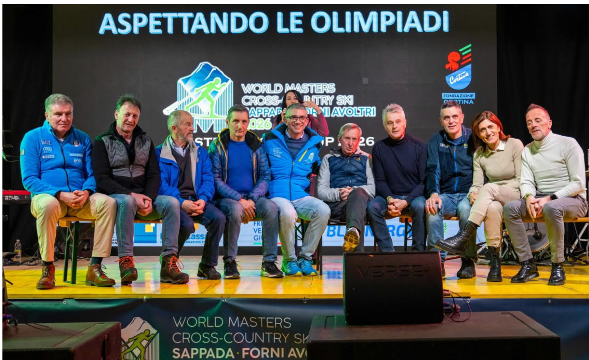
Italian Olympic legends on stage in Sappada