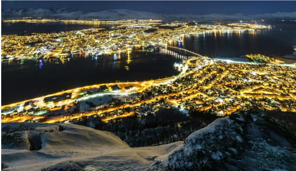
Tromsø, Norway, host city for 2027