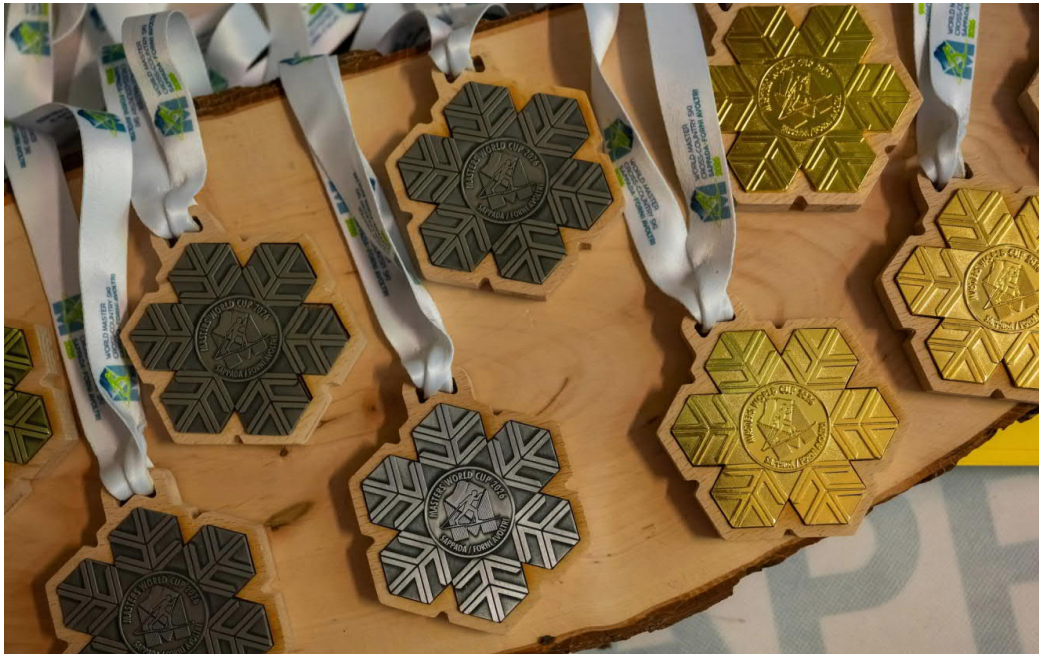
Medal selection for the winners

Relay results at the Forni Avoltri Biathlon Stadium: